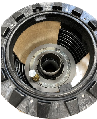
Inside typical UST Spill container

47-20-USTWO Includes: Fill Cap (not shown) Fill Adapter 4" Adapter Coupling 47-20 Overfill Valve Not included: Internal Riser Pipe-contractor supplied length TBD by installation instructions