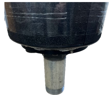
Typical UST Spill bucket. Showing Riser pipe that attaches to the 4" fitting on the UST.

47-20-USTWO Includes: Fill Cap (not shown) Fill Adapter 4" Adapter Coupling 47-20 Overfill Valve Not included: Internal Riser Pipe-contractor supplied length TBD by installation instructions